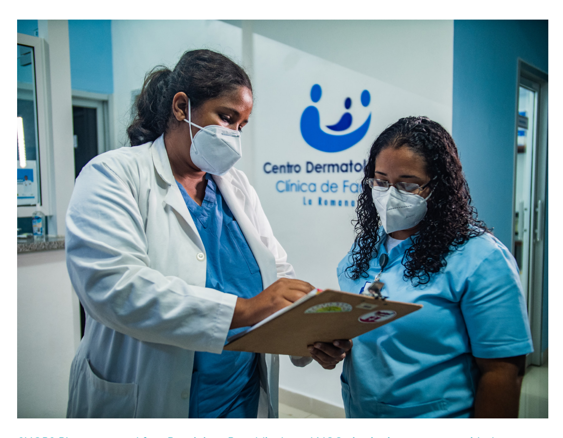
SHOPS Plus supported four Dominican Republic-based NGOs in signing contracts with the national health insurance agency and finding new revenue streams. Pictured here is one of the NGOs, Clínica de Familia.

While there is increased recognition that the private health sector is an important partner to engage in the pursuit of public health goals, countries vary widely in their level of public-private engagement in health. Some countries already have many of the foundational elements, such as up-to-date data, strong stewardship capacity, an enabling environment, efficient partnership tools, and mechanisms that promote dialogue, while other countries' efforts are nascent. There is not a "one size fits all" approach. It is essential that donors and implementing partners tailor approaches to the country context and the readiness and capacity of local entities to engage and partner with one another. A successful and sustainable approach to public-private engagement requires strong political leadership coupled with the presence of champions who can lead change. Donors can play an important role in identifying and supporting that leadership, and in facilitating a country-led engagement process.