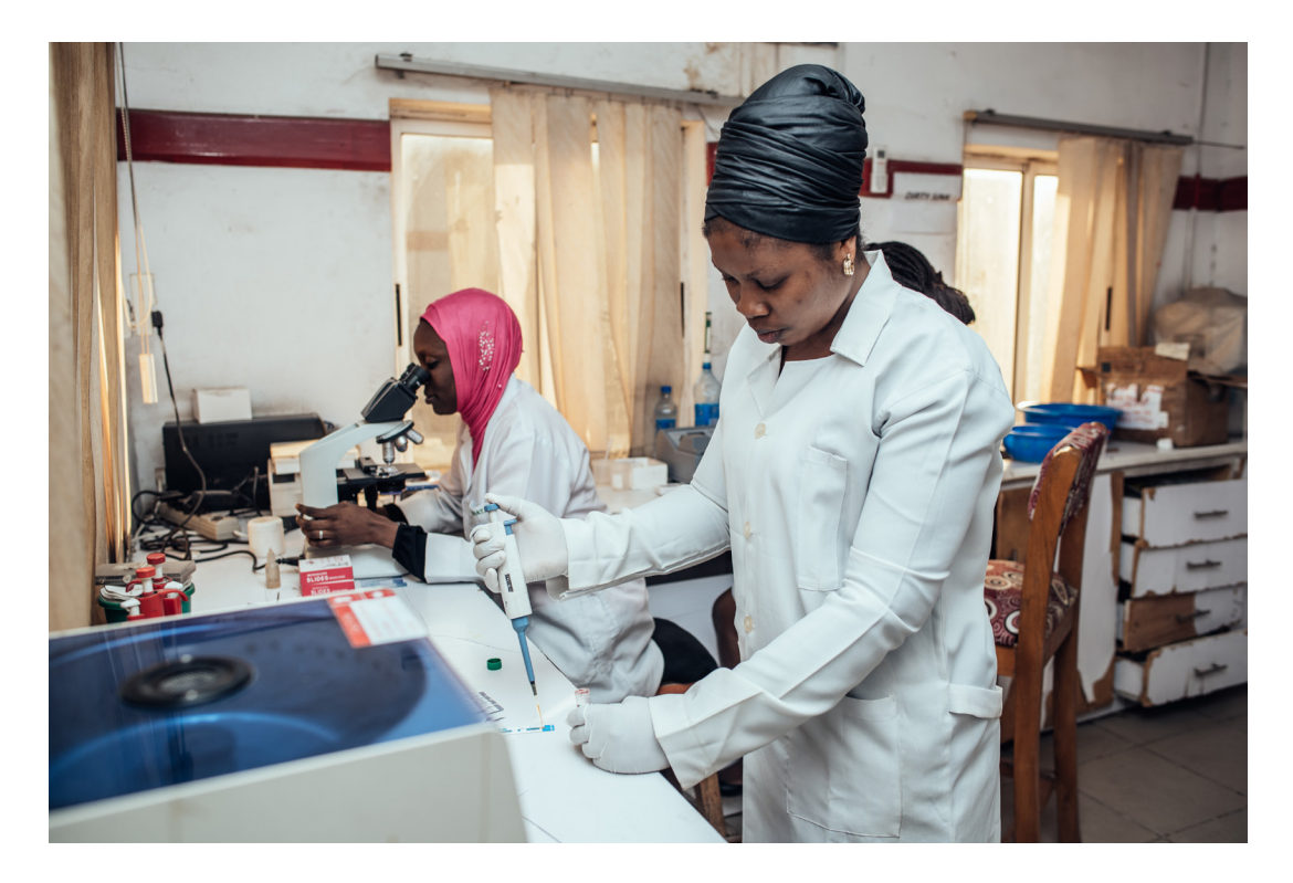
Technicians test sputum samples from presumptive TB patients in a networked laboratory in Kano state.